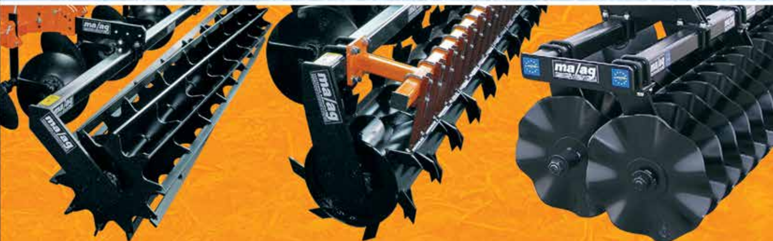
Single cage roller, mechanical setting