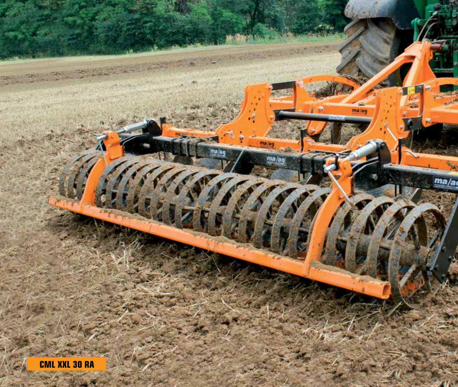
CML XXL 30 RA