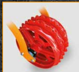
CAST IRON ROLLER