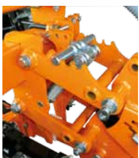
PRE-LOAD SYSTEM WITH ADJUSTABLE SPRING STANDARD

The medium HP needed for single unit "strip" is around 25 HP (18,4 KW) for adjustable HP from 100 HP (73,6 KW) for equipments of 4 rows and over 200 HP (147,2 KW) for the 12 rows. In fact, the technique can also be used with small tractors ... in a view of a more sustainable agriculture.