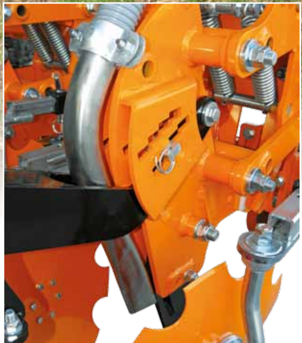
CONDUIT FOR THE INSERTION OF THE FERTILIZER OPTIONAL

The "Combi STRIP" is available in different dimensions: 4 rows with fixed frame, or 6-8-12 rows with hydraulic foldable frame for the transport on road, for working width from 2,50 to 6,00 m.