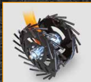
COUPLE OF TRACING WHEELS