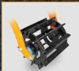
REFINER CAGE ROLLER, WITH STRAIGHT PLATES