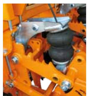
PRE-LOAD SYSTEM WITH PNEUMATIC BELLOW OPTIONAL