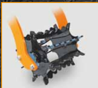
REFINER CAGE ROLLER, WITH TOOTHED CURVED PLATES